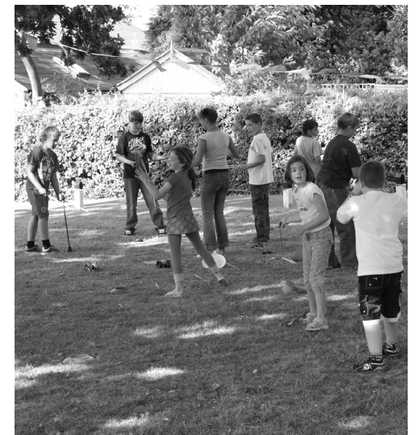
A similar event held last July raised £600 for the 'Children of Chernobyl'